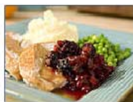
Bobby's Cranberry Sauces