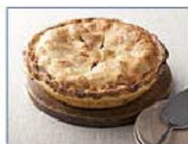
Ina's Deep-Dish Apple Pie