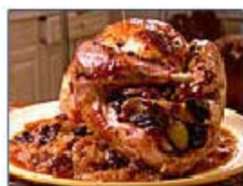
Mexican Drunken Turkey